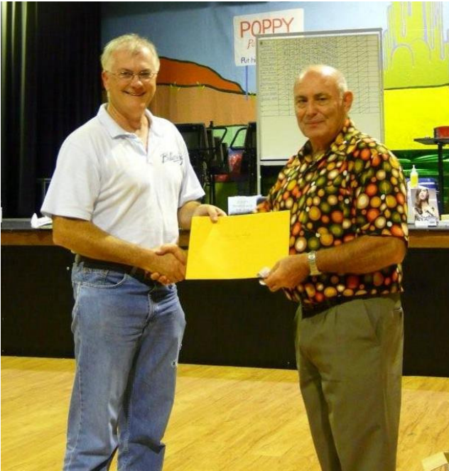
Winner of Golden Showcase Jewellers prize